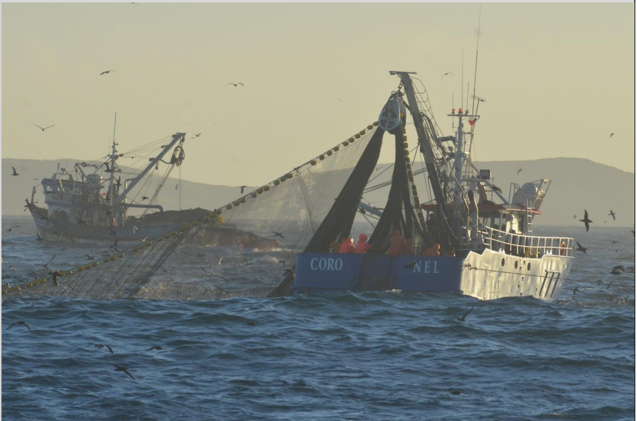
Image: Seabirds attracted to a purse seine vessel fishing for sardine

32 observers trained in seabird conservation