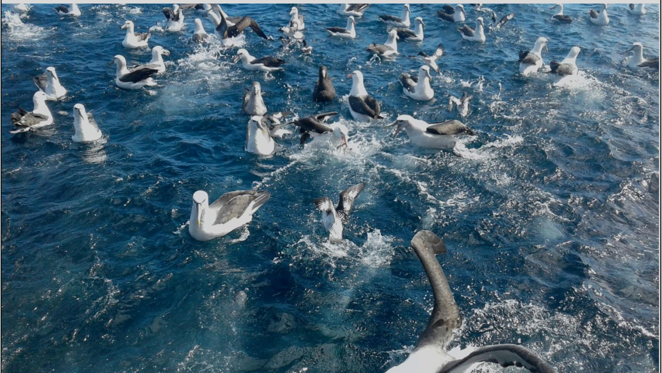
Image: Albatross eating offal discharge

Improved line weighting regulations in law