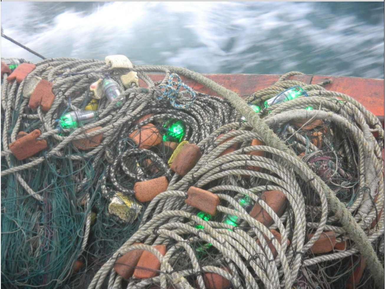
Image: Net lights on a surface gillnet in Peru

70 fishermen trained in bycatch recording and animal handling