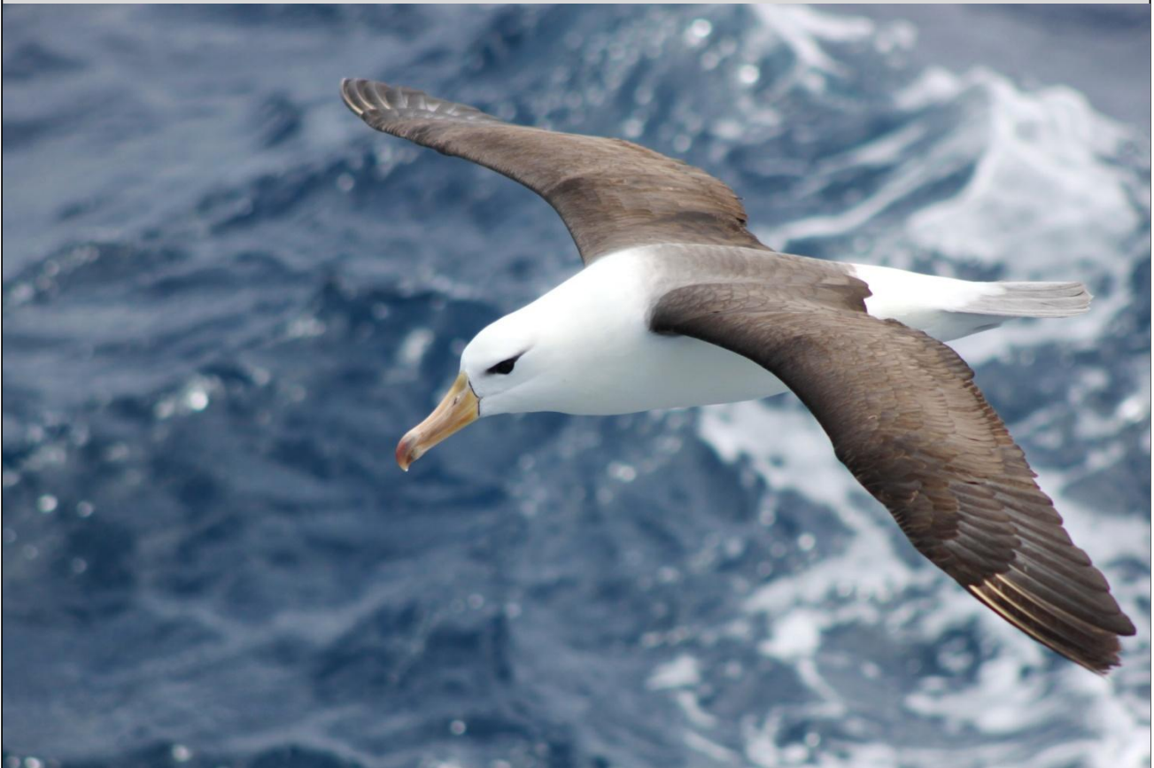
Image: sub-adult black-browed albatross soaring past a longline vessel

80% compliance with light weighting regulations in 2016